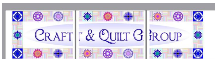
Banner size 3 x A4