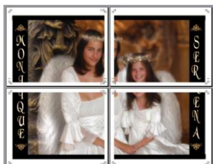
Poster size A4 x 4

The printer will automatically split the pages and leave a margin. This margin is used as your seam allowance.